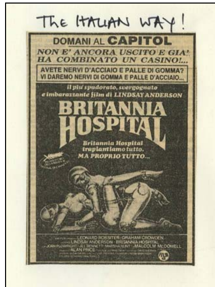
LA/1/9/5/3, Italian press advertisement for Britannia Hospital , Lindsay Anderson Collection, University of Stirling

Anderson's pessimistic expectation of the film's critical reception in the US proved unfounded. Many of the US critics noted the comedic elements of the film using terms such as "witty", "outrageous", "wildly comic". In a review of the film's performance in Box Office in June 1983 it was noted that "there's no reason that this film shouldn't go on to become a classic ranked with the likes of A Clockwork Orange and Dr Strangelove ." 14