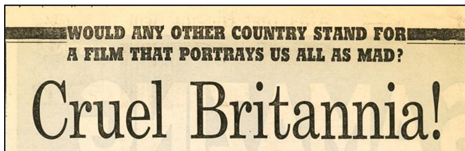
LA/1/09/6/1/18, The Daily Mail, 18/05/1982, Lindsay Anderson Collection, University of Stirling

In Anderson’s own words, in a letter to the American film critic Vincent Canby “the English gave BRITANNIA HOSPITAL a fearful pasting” 10 . Anderson thought it was more the broadsheets than the tabloids who reacted so badly, however, looking at a broad range of the British reviews, it appears this distinction is not quite so clear cut. There were some exceptions but the negative reviews ranged from tabloid papers to broadsheets, and through youth publications like the NME and Time Out .