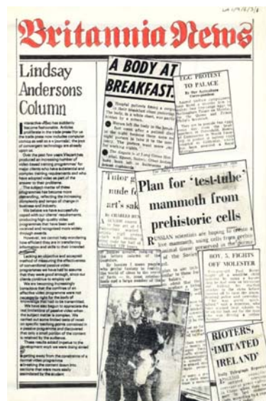
LA/1/9/6/3/1, mock-up newspaper created by Lindsay Anderson, Lindsay Anderson Collection, University of Stirling

The main part of my job is cataloguing, to item level, the correspondence and diaries in the Anderson Collection. In the Britannia Hospital file alone there are over 300 letters,