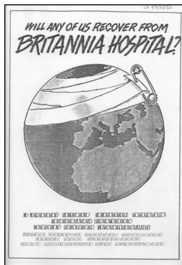
LA/1/9/3/12/1, design possibility for UK advertising campaign for Britannia Hospital , Lindsay Anderson Collection, University of Stirling