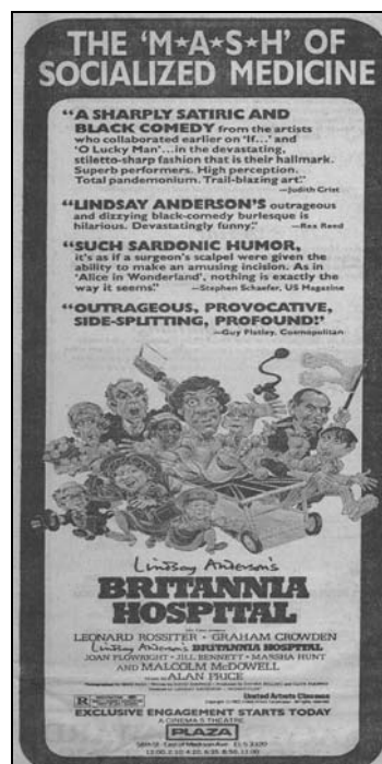
LA/1/9/5/3, American press advertisement for Britannia Hospital , Lindsay Anderson Collection, University of Stirling

Anderson collected press cuttings of reviews and advertisements for his work. Friends, and sometimes press agencies, would send him the press cuttings and in some cases, books of compilations of press cuttings. He liked to control the promotion of his work as much as possible, and although (I don't think!) he never went so far as I hear Kubrick did, measuring the size of published advertisements to ensure they had followed his directions, he did keep a close eye on the promotion campaigns and controlled it as much as he was able to. I thought it would be interesting to show a few of the images of advertisements from other countries, Italy, America and Hungary, to illustrate the different audiences the film was being promoted to in these countries.