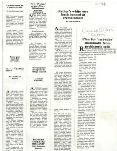
LA/1/09/6/2, press cuttings contemporary to Britannia Hospital , Lindsay Anderson Collection, University of Stirling

I consider myself very lucky to be cataloguing such an interesting and valuable collection and I still get surprised by how much wonderful material I come across. These next two images give us a valuable insight into the amount of preliminary research Anderson did, and the sources of inspiration for his films, in this case the first image is one of many (a whole folder full) of press cuttings which Anderson photocopies, cut out, then re-assembled, of stories which were inspiration for the film. The second image shows a booklet which Anderson made by assembling press cuttings, like those in the previous image, as a mock-up newspaper.