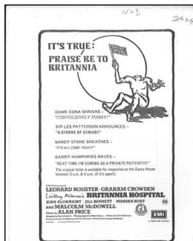
LA/1/9/3/12/1, design possibility for UK advertising campaign for Britannia Hospital

The Collection contains material which the PR agency produced for the promotion of the film, and Anderson's own ideas on how the film should be promoted.